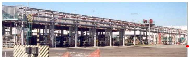
The Porto Terminal of PETROGAL is the largest in the country and one of the very largest in the whole of Europe. It supplies the whole of Northern Portugal and also areas of Northern Spain. The traffic load is about 800 trucks per day.